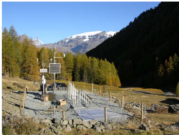
FIGURA 212: THE METEOROLOGICAL STATION

Installing a weather station experimental, funded by Regione Autonoma Valle d'Aosta, it was possible observe the weather climate parameters for the years 2010-2011. The data has allow to define an expeditious methodology for estimating the quantity of water (SWE) using the instrumentation of a standard meteorological station at high altitude.