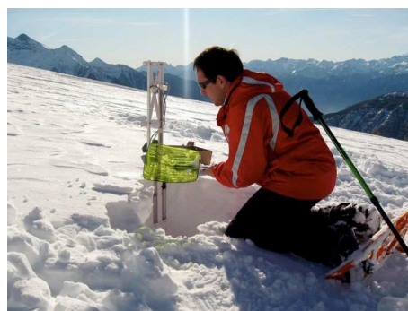
FIGURA 215: FIELD ACTIVITY