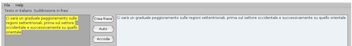
Figure 1. Segmentation window

ALEA allows the user to import Italian text for the translation. The text is then automatically segmented into sentences. The user can also select the sentence to be