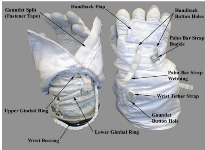
Figure 4. Phase VI Glove Assembly 18

bearings were replaced with bushing assemblies.