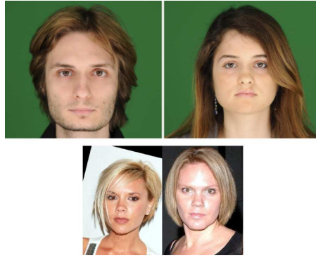
Figure 1: Pairs of siblings from the HQfaces (top row) and from the LQfaces (bottom row).