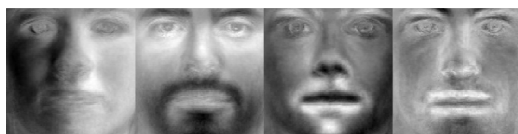
Figure 4: Best eigenfaces for dataset ii.

We have found that the eigenfaces more significant for discriminating siblings are relatively stable with respect to the pairs dataset used. To support the thesis that the described technique is sufficiently general to also work with other databases of siblings, we performed further tests subdividing each of the 6 pairs datasets into 4 not intersecting subsets, composed by an equal number of siblings and not siblings. For these subsets, we obtained again similar eigenvectors from mRMR. An example of the eigenfaces selected by mRMR is shown in Figure 4 for frontal HQfaces.