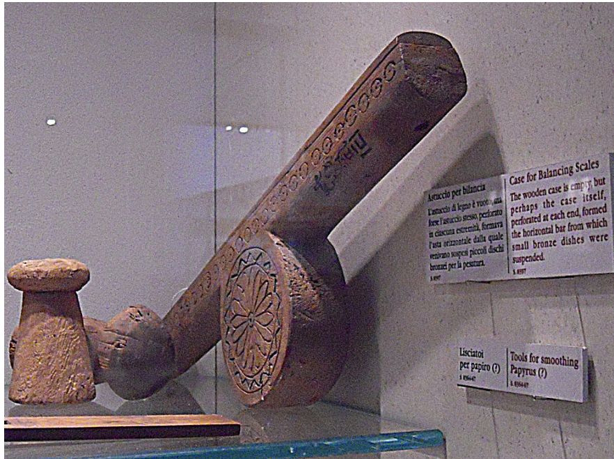
Fig.1 The label is telling that the object is the case of a balance scale (Egyptian Museum, Torino)