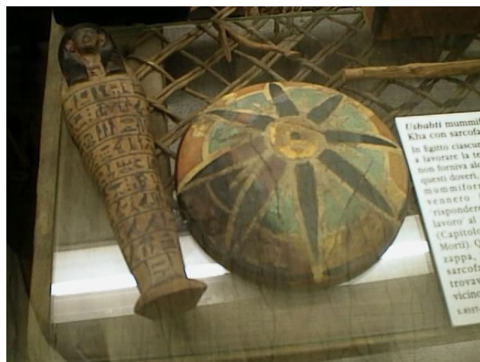
Fig.4 A “rose of direction”, from the Kha’s Tomb.