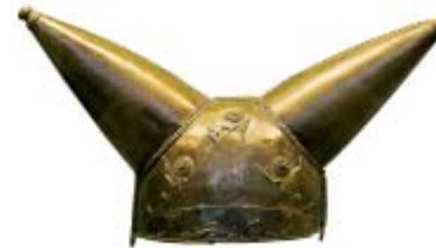
A Celtic helmet

The historical Celts were a diverse group of tribal societies in Iron Age Europe. Proto-Celtic culture formed in the Early Iron Age in Central Europe (Hallstatt period, named for the site in present-day Austria). By the later Iron Age (La Tene period), Celts had expanded over a wide range of lands: as far west as Ireland and the Iberian Peninsula, as far east as Galatia (Central Anatolia), and as far north as Scotland.