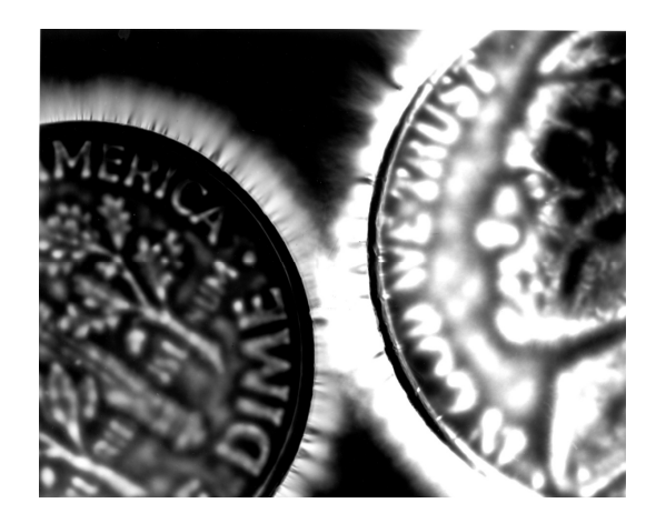
Fig.2. A Kirlian photography of coins, from Ref.6.