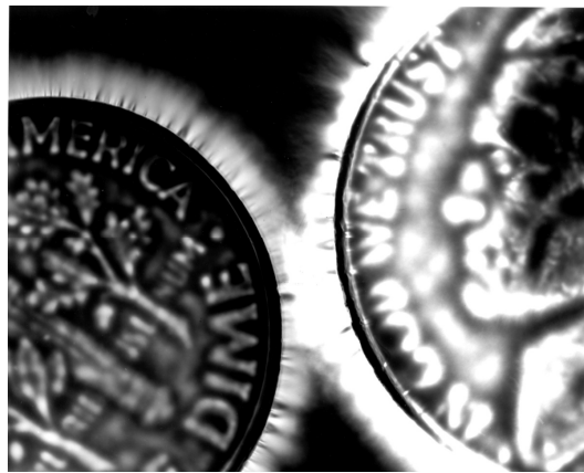
Fig.2. A Kirlian photography of coins, from Ref.6.