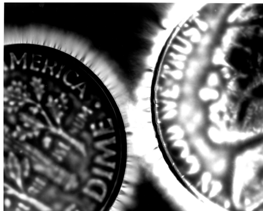
Fig.2. A Kirlian photography of coins, from Ref.6.