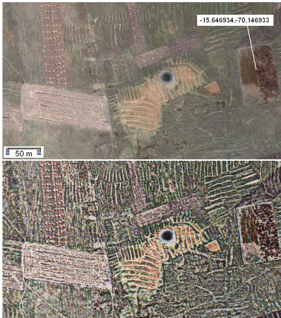
Figure 2: Many interesting drawings are displayed in the satellite imagery of this land. Among them, there are some which look as geo-glyphs. Here we see a bird, where a circular pond is the eye. In the upper panel, the original image from Google, in the lower part the image enhanced with a previously proposed method [8].