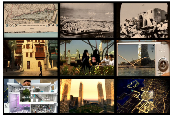
Figure 2. Restoring Historic Jeddah, 2008. ( http://www.squintopera.com/#/projects/?id=104 )

3D model is photorealistically rendered using natural lights and materials. At the opposite pole, referring to the aims - documentary in the previous case, projectual and promotional in the following one - and to the use of imagery language, the film (5:51) for the redevelopment of Jeddah Central District describes a project both for the requalification of historical city centre and the development of the waterfront. For this reason the movie joins images of the existing historic core with others of the new master plan as is resumed in the conclusive slogan “Jeddah Heritage and Modernity”. First part of the movie, about 1:40, is dedicated to the representation of old city centre, starting from an ancient map of Arabia on which sailing ship and caravans head toward Jeddah. Then, some old photographs representing the architectural heritage and the human activities are overlapped by 3D digital models of the same places. These, are now animated by interventions of renovation and transformation of façades and open spaces.