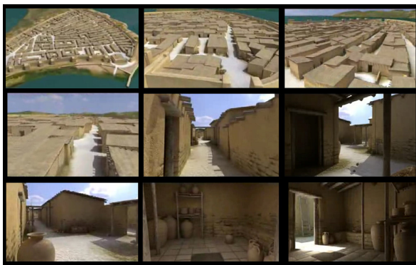
Figure 1. Lattes Archaeological 3D Reconstruction, 2008. ( http://www.youtube.com/watch?v=6oseC0Yuc94&feature=channel_page )

Below we will analyze one video realized to be posted in cultural website as well as in museum installation and for this reason characterized by educative purpose and short duration.