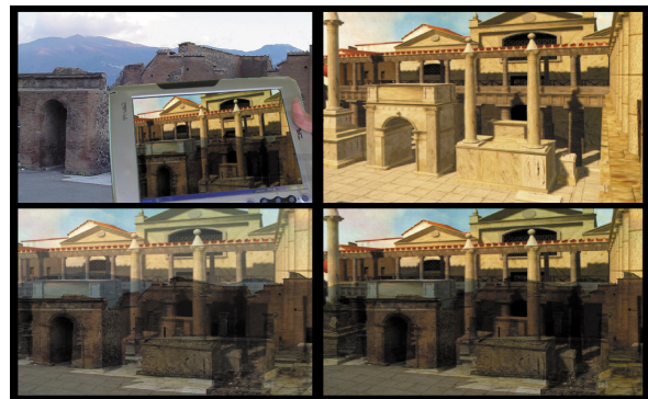
Figure 6. AR technology using RealArcheo

The main purpose of the project is the production of a hardware and software system that enriches the usual visit of a cultural heritage with three-dimensional multimedia and interactive items, in order to restore the site to its original appearance, in order to tell its history.