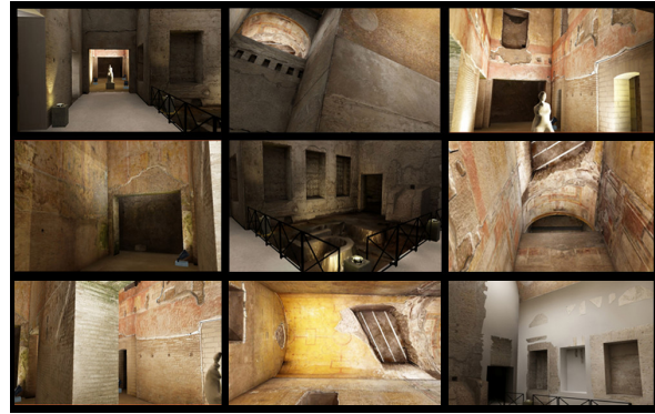
Figure 5. VR real time 3D of Domus Aurea. ( http://www.orangeengineering.it/real_time_3d_domus_aurea.html )

The digital reconstruction of a part of the Domus Aurea, was commissioned by the Soprintendenza dei Beni Archeologici di Rome to Orange Engineering, an engineering company that is active in many fields, from the town-planning to the architectural restoration, using innovative tools such as 3D animations, interactivity, real time 3d. Nowadays, the virtual exploration of this archaeological site is the only way to appreciate its beauty.