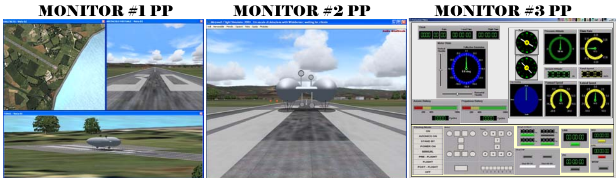
Figure 5: Pilot Station

After the post-flight procedures have been concluded, the GS can be prepared for the re-entry operations: the pilot cabin is retracted and the levelling system is disabled, making the GS look like a normal camper. Considering the overall dimensions and the motor size, a standard driver licence of type B is considered the minimum requirement for the driver. The GS is perfectly independent during transfers. When operative, however, it relies on a second vehicle, which transports a 12kVA power generator and a three-phase 380/220V AC transformer.