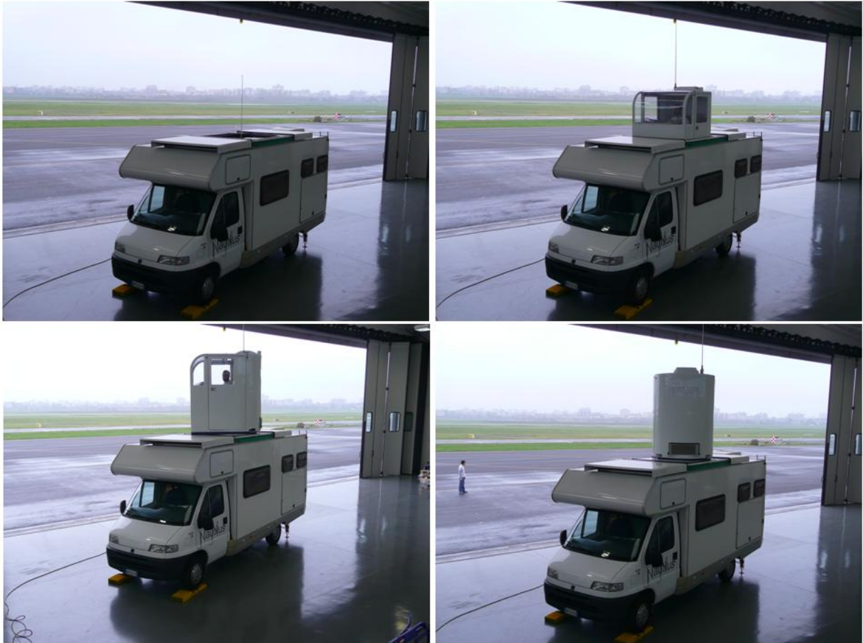
Figure 3: Pilot cabin movement system in the Mobile Ground Station

The cabin is lifted over the roof level by the hydraulic system. Rotation is actuated through a brushless motor coupled to an endless screw which ensures irreversibility. This mechanism should provide the pilot with a 360° view on the airship and on the surrounding environment, to respect the line-of-sight requirement imposed at the present by the aeronautical civil authorities.