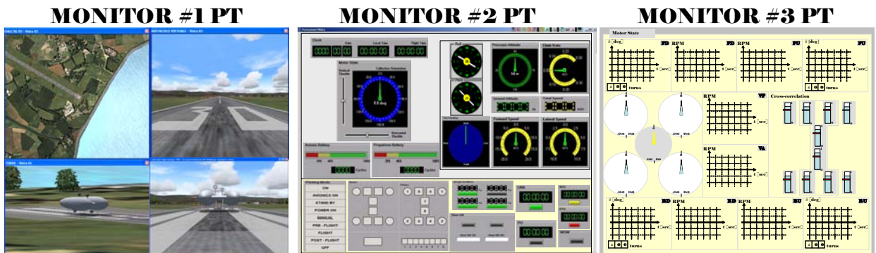
Figure 6: Technical Station

The Pilot and Technical stations are basically equipped with the same hardware and are specialized by proper software in the moment they became operative. Additional hardware might be necessary for the Technical Station, depending on the payload features. During flight tests on the demonstrator, however, the Technical Station is completely dedicated to the flight parameter analysis and is provided with all the information required to identify any possible source of failure 9 . Both the stations have monitors, where the real images broadcasted by the onboard video-cameras are integrated with synthetic scenarios. The Pilot Station, whose main concern is piloting, is provided with four views of the airship distributed on two monitors. The arrangement has been conceived in order to have the pilot focused on the rear observer point of view, such as the one shown in the central image of Figure 5. This view proved to be particularly useful in remotely piloting, when the pilot has no direct feelings of the aircraft attitude and movement 10-11 .