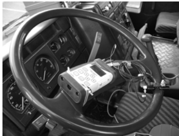
Figure 3. Adapter and measuring instrumentation fixed on a truck steering wheel.

The dynamic variations and the effects of shocks produced by the hands on the steering wheel during the drive have to be carefully taken into account, because they also can cause an overestimate of acceleration levels (in particular for medium-high frequencies).