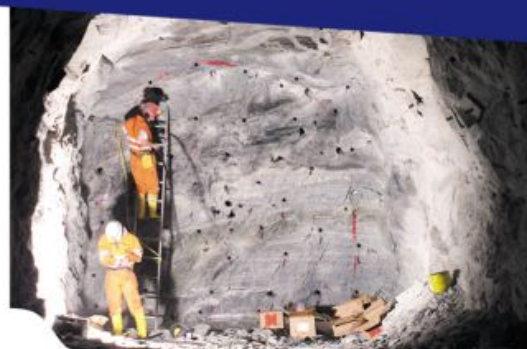
"Fontana" mine - Torino