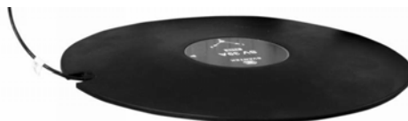
Figure 1. Triaxial accelerometer for seats, according to EN 30326-1 (1994) and ISO 10326-1 (1992) (from technical documentation of manufacturer).

The accelerometers have to be surely fixed on vibrating surfaces, via magnetic fixing, glues, bolts, etc.; special adapters are provided for special measuring condition, as measurements on driver’s seats (Fig. 1) or equipment’s handles (Fig. 2).