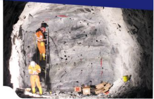
*Fontane* mine - Torino