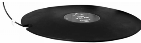
Figure 1. Triaxial accelerometer for seats, according to EN 30326-1 (1994) and ISO 10326-1 (1992) (from technical documentation of manufacturer).

The accelerometers have to be surely fixed on vibrating surfaces, via magnetic fixing, glues, bolts, etc.; special adapters are provided for special measuring condition, as measurements on driver’s seats (Fig. 1) or equipment’s handles (Fig. 2).