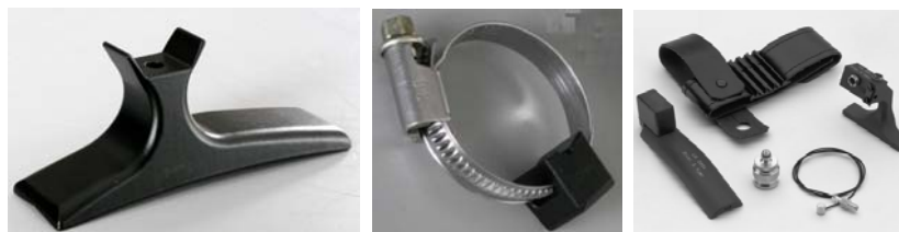
Figure 2. Commercial adapters for different handles (from technical documentation of manufacturers).

Obviously, all fixing systems must have an adequate frequency response, in order not to affect measurements, and measuring instrumentation’s mass should be small if compared with measured machine (or equipment) mass, to avoid dynamic coupling conditions between vibration source and human body. Furthermore a problem arise when hand arm vibrations are measured, since the presence of the measuring probe can modify the normal and correct way of use of the tested equipment; the minimization of this uncertainty factor substantially depending on the experience and “sensibility” of the technician and on the availability of suitable adapters.