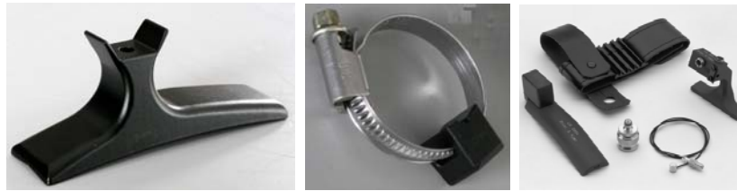
Figure 2. Commercial adapters for different handles (from technical documentation of manufacturers).

Obviously, all fixing systems must have an adequate frequency response, in order not to affect measurements, and measuring instrumentation’s mass should be small if compared with measured machine (or equipment) mass, to avoid dynamic coupling conditions between vibration source and human body. Furthermore a problem arise when hand arm vibrations are measured, since the presence of the measuring probe can modify the normal and correct way of use of the tested equipment; the minimization of this uncertainty factor substantially depending on the experience and “sensibility” of the technician and on the availability of suitable adapters.