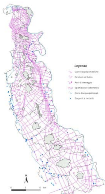
Figure 2: Water table aquifer Map

gravely-complex and sometimes in morainic complex, extends itself over the plain area. Only the deeper part of the morainic structure is interested by this aquifer, while in the superficial region secondary perched aquifers can be found. The groundwater flow pattern is shown in Figure 2