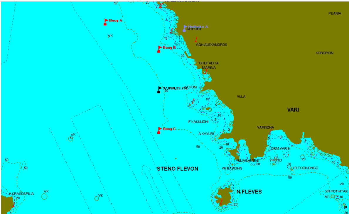
Fig. 2. Position of the Helliniko Airport AWS and the buoys in the Saroniko Gulf.

on the Peloponnesian arrives, the wind turns S and become stronger.