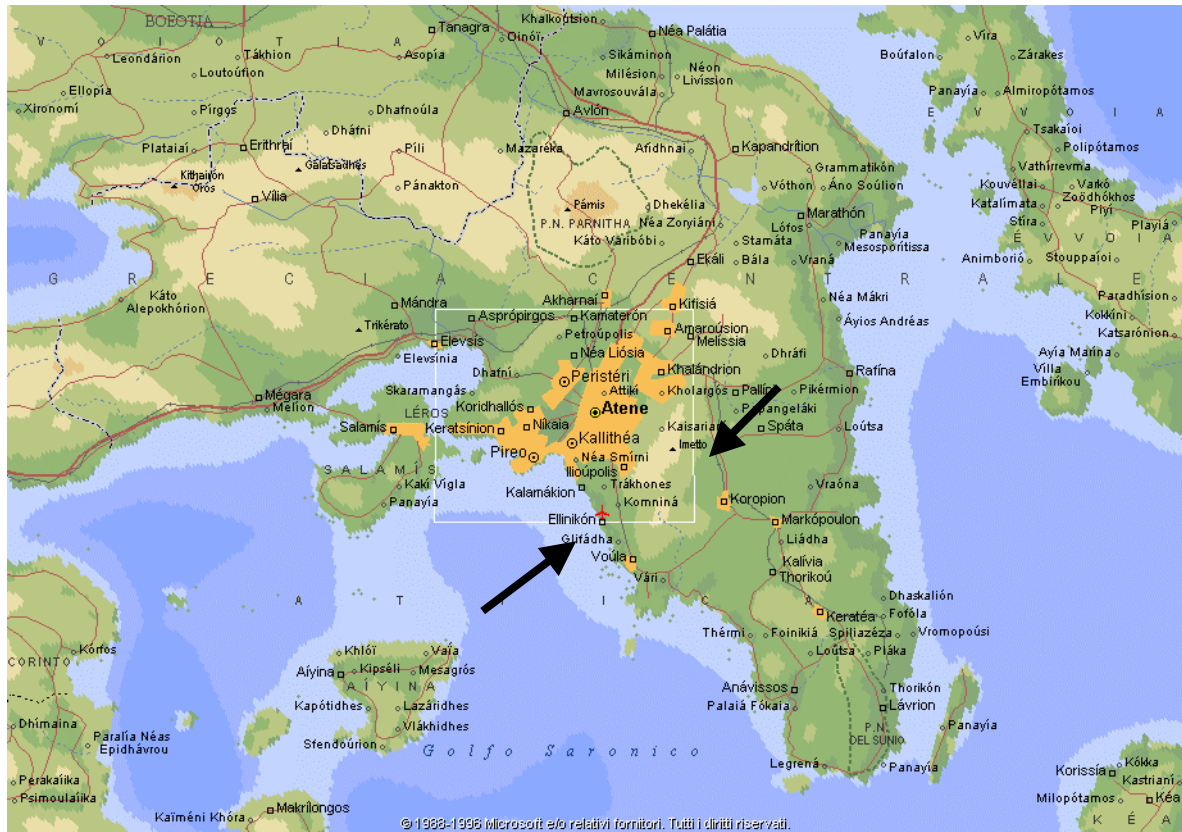
Fig. 1. Saroniko Gulf. The flags show the principal direction of the sea breeze from SW and of the Etesian wind from NE.