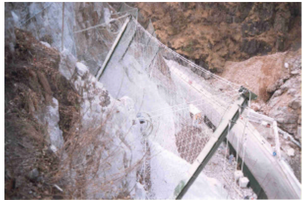
Figure 1. View from the upper part of the rock slope: some net fences are visible and in the right side the existing road.

In the area surrounding the adit also some detritic surface formation occurred and for this reason the remedial works were made of wire mesh and bolting (for the fractured rock mass) and net fences (for the debris protection).