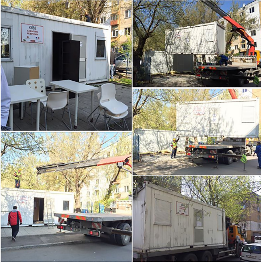
Figure 5: Disposition of Caracuda—the only harm reduction centre in Ferentari