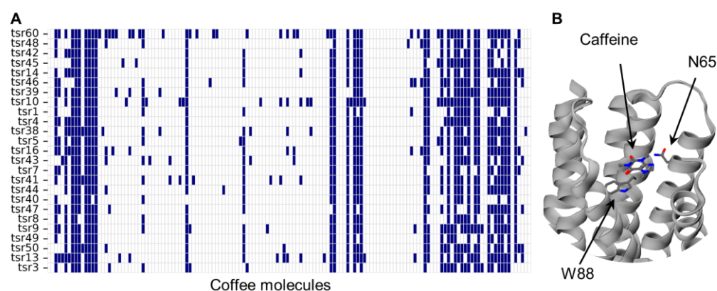
Figure 3. (A) Coffee Fingerprint: is a matrix where each box identifies a possible interaction between a bitter taste receptor and a molecule (Coffee Dataset). A blue box indicates a favourable, whereas a white box denotes that the interaction is unlikely. (B) Visual rendering of caffeine binding pose in TAS2R46.