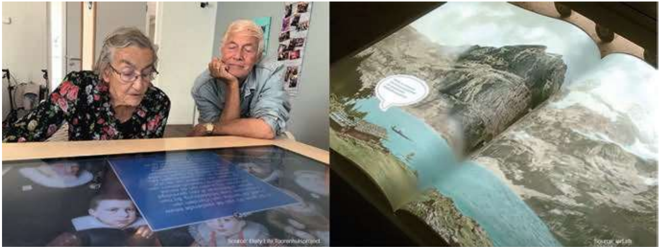
Fig. 8. Touchscreen tables in a nursing home in the Netherlands (left); video projections on an interactive book at the National Museum in Zurich (right).

Finally, new technologies include 360° and video mapping projections. Such immersive solutions are rapidly evolving and accustoming people to enjoy digital content in public spaces and buildings. These projection systems are suitable for collective appreciation in different environments: on surfaces that are not necessarily flat (often being circular, spherical or cubical) or on existing and newly created three-dimensional objects. These technologies make it possible to transform any surface into a dynamic display, creating highly involving and immersive effects for the spectator. A good example is one of the four interactive books in the National Museum in Zurich (fig. 8, right), which allows visitors to explore the nation's stories and events.