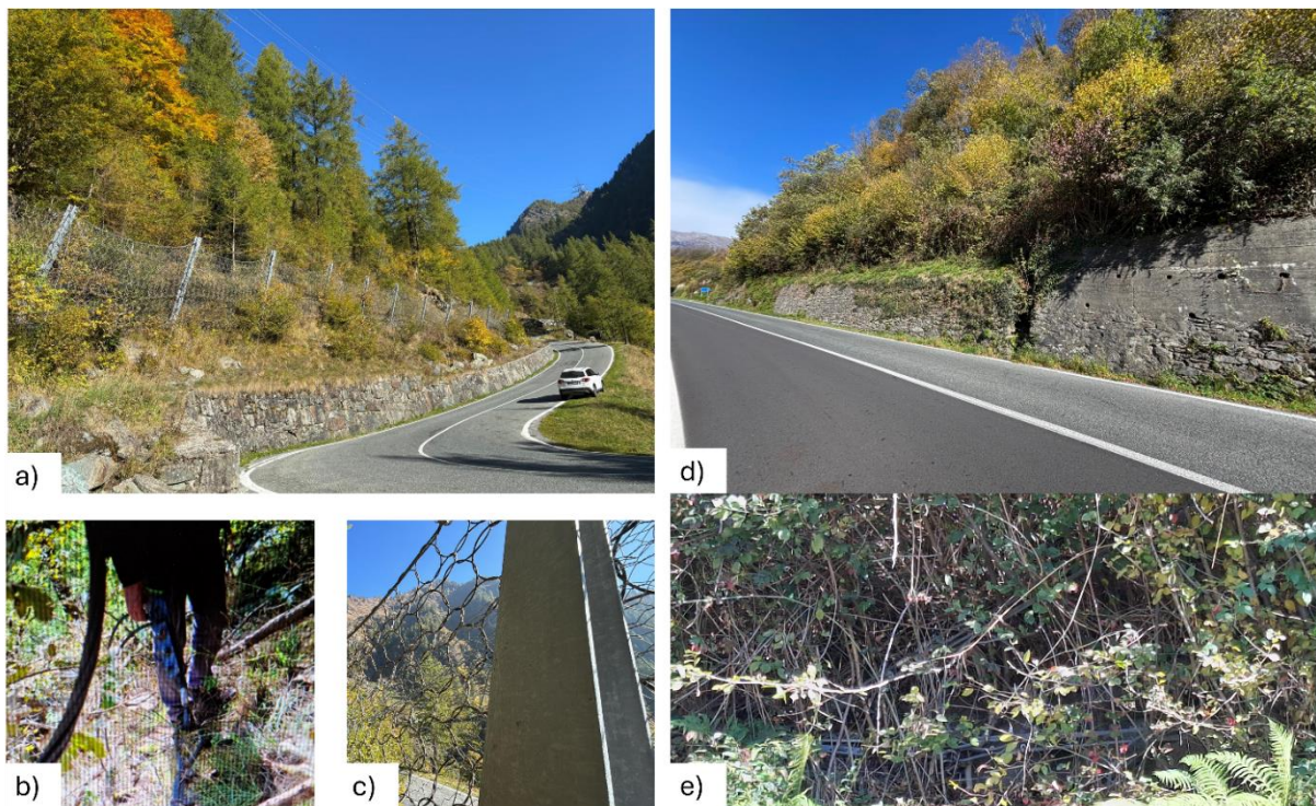
Fig. 2 (a) Overview of Barrier 1, (b) anchor not grouted, (c) tearing of the mesh (d). Barrier 2, (e) rope anchor.

Considering that the barrier is located in an area with frequent rockfall events (high hazard), and that the road protected by the barrier serves as a critical transport route (high exposure), the CdA results high.