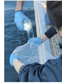
Img 2: AKANoah Team member during a Po river sampling