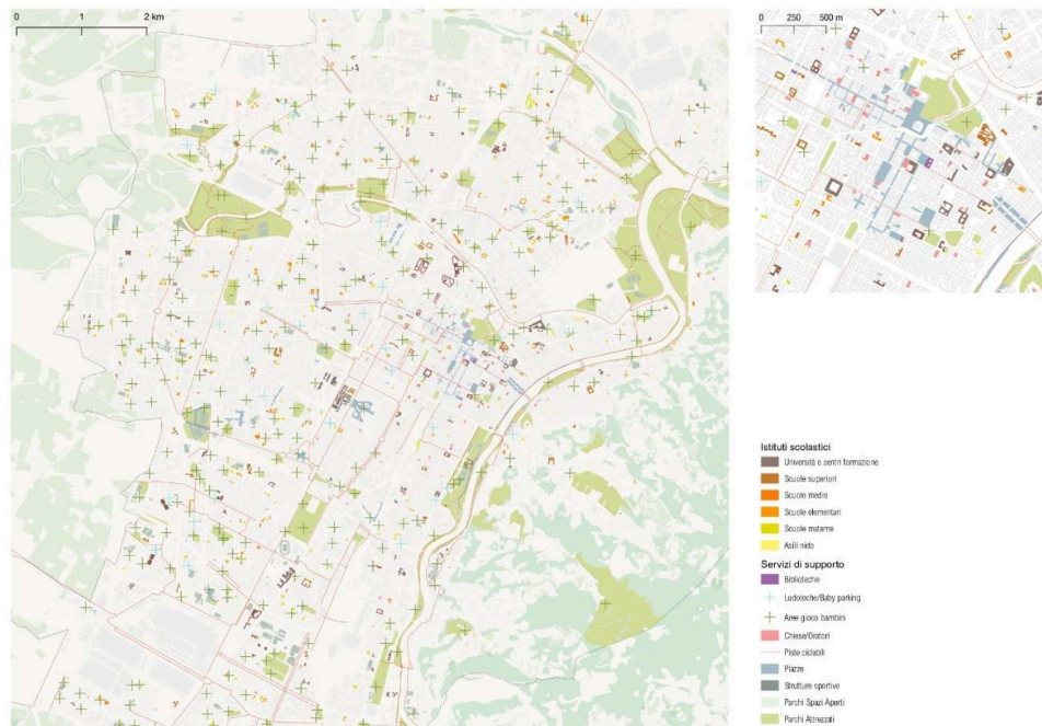
Figure 1. The spatial infrastructure dedicated to the educational experience in Turin (schools, parks, sports fields, and parishes)

The map sees how denser spots emerge, capable of showing already existing clusters that may favor a school open to the territory and in synergy with it.