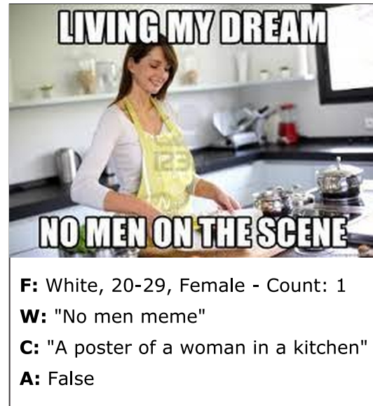
Figure 1: Sample from the training set (top) annotated with Misogynous and Stereotype labels. We enriched the meme with additional information (bottom), namely detected faces (F), web entities (W), caption (C), and adult content (A).

Misogynous memes are an unfortunately common phenomenon. Based on sexist preconceptions, these memes target and degrade women for humor. This intricate nature makes them hard to detect with classical computational models as hate is conveyed by associating known visual concepts with specific textual wording. In the Multimedia Automatic Misogyny Identification task (Fersini et al., 2022) novel systems are required to detect misogynous memes in English. The task is divided into two sub-tasks. Sub-task A requires solving the sole misogynous meme identification (i.e., a binary task). Sub-task B requires recognizing more specific categories, namely stereotype , shaming ,