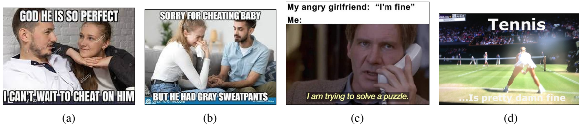
Figure 4: A sample of false negatives from the test set on the misogyny identification task.

score composed of a promising 75% in precision and 71% recall. While performance between stereotype and objectification are close, the system underperformed in the shaming category. We think this behavior is due to the broad kind of both visual and textual content that can convey shameful messages and is hence more difficult to learn. Finally, the model performed best in violence , where it is probably simpler to identify visual clues that let intend a violent message.