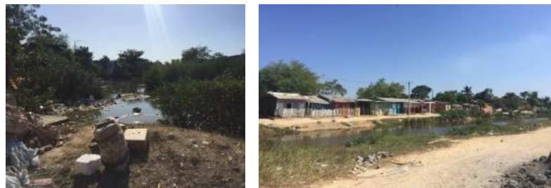
Figure 2. The bodies of water are in a high state of disrepair. Photos taken during the visits to the neighbourhood

El Pozón began in the early 1990s as an illegal neighbourhood, an invasion of the La Virgen swamp by people arriving mainly from villages and rural areas of the region. Many of them obliged to migrate because of forced displacement and violence. The form of occupation was based on the principle of the "4 sticks' law": this stated that whoever took possession of a plot on the water of the swamp, with a maximum size of 6x12 metres and took responsibility for filling it, could consider him/herself the owner of the land and could build his/her house. Some