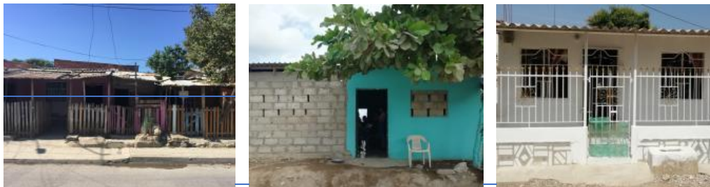
Figure 1. Informal houses of El Pozón with different levels of consolidation. Photos taken during the visits to the neighbourhood

The historic centre of Cartagena de Indias is the most important tourist nucleus in the country. However, investigating the city's most recent history, it can be noticed a very serious imbalance between the more central areas and the outskirts, arising social problems - that affect most of the contemporary Colombian cities - such as insecurity, poverty, deficit in services and infrastructure and environmental issues (Ayala García & Meisel Roca, 2017). One of the most famous neighbourhoods on the outskirts is El Pozón , located in the far north-east area of the city. Its history is representative of the invasion phenomenon which remains today one of the most practised means of space occupation in popular sectors. Generally, these are areas of suburban or rural expansion established out of the bounds of the administrative borders.