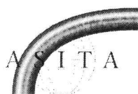
Federation of Scientific Associations for Territorial and Environment Information