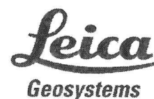
Leica Geosystems S.p.A.