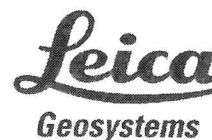
Leica Geosystems S.p.A.