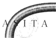
Federation of Scientific Associations for Territorial and Environment Information