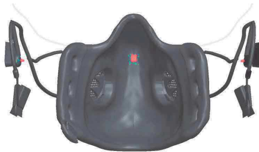
Fig. 2 Three-dimensional rendering of the AG-47 SmartMask with the positions of the main sensors highlighted in red. In the configuration shown, the mask is presented with a replication factor of 1 for the thermo-hygrobarometric (full red square) inside its facial containment cavity and with a replication factor of 2 for the intraural thermal sensors (red cones) and the pulse oximetry sensors for the ear lobe (black pliers)

The so-called “active” action of the filter naturally adds to that of the “passive” type carried out by the non-woven fabric materials of which the common surgical masks are made. The dual “active-passive” functionality with which the filter of the AG-47 SmartMask is equipped is obtained by inserting a layer of a special, suitably spun conductive fabric (active filtering zone) between the two surface layers made of non-woven fabric materials (passive filtering zone). The active function of the mask is ensured by a low voltage power supply which must