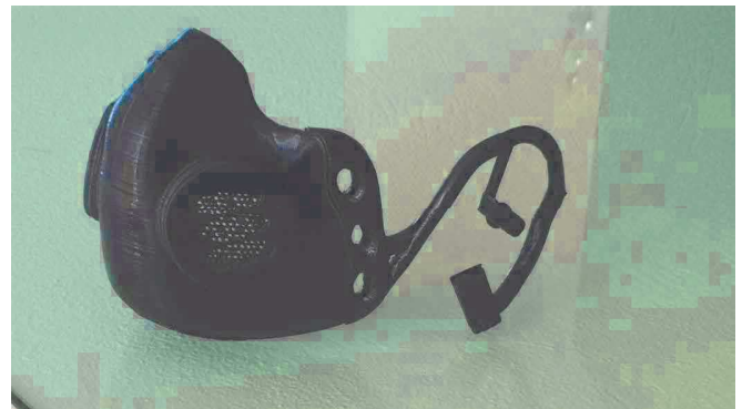
Fig. 1 The tridimensional image of the AG-47 SmartMask prototype is shown where the left filtering element, in the form of an interchangeable disk, is clearly visible together with the semi-rigid connection arm to the homologous ear in which some sensors are located

Coronavirus disease 2019 (COVID-19) is a rapidly expanding global pandemic that causes severe acute respiratory syndrome (SARS-CoV-2), and could result in significant morbidity and even mortality. The most frequent prodromes of COVID-19 infection are fever and signs/symptoms of incipient respiratory diseases such as cough and shortness of breath or tachypnea [1]. However, it is not infrequent that in patients infected with COVID-19, in addition to respiratory manifestations, cardiac rhythm alterations are also present which can be the early sign of an acute cardiovascular syndrome (ACovCS) [2]. An almost obligatory