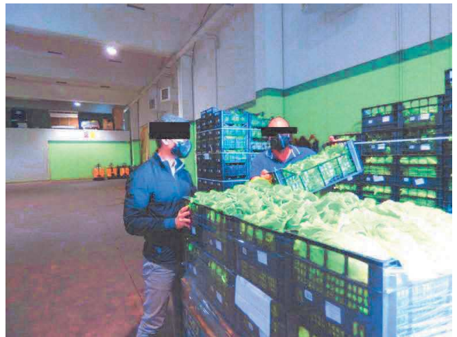
Fig. 5 The image shows two workers engaged in their usual duties along the packaging chain of vegetable products, each wearing an AG-47 SmartMask whose periaural extension is not visible as it is placed in the left ear. It can be clearly observed that the inter-individual distance is somewhat reduced and for this reason the anti-COVID-19 facial protection device is certainly suitable.

At the end of the segmentation and features extraction process, the MCU proceeded to classify the recognized features to determine the physiological parameters of interest, as described in the previous paragraphs. Thus, for example, the classification of the barographic, thermographic and hygrographic curves led to the identification of the respiratory