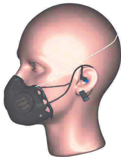
Fig. 4 The lateral perspective in the dummy head wearing the AG-47 SmartMask shows both the intraural thermal sensor and the pulse oximetry sensor at the ear lobe

As shown in figure 4, a thin, flexible arm connects the face mask both with the external acoustic meatus of the ear, inside which the interior body temperature sensor is positioned, and with the earlobe clamped by the pulse oxymetric sensor. As is known, when the partial pressure of oxygen in arterial blood ( P_pO_{2-a} ) falls below 100 mmHg, hemoglobin does not bind totally to oxygen as its chemical affinity for this respiratory gas is inversely proportional to P_pO_{2-a} . For this reason, when this blood that is not totally saturated with oxygen (in clinical practice a value that oscillates between 95% and 98% of the maximum is considered normal saturation since 100% is not physiologically obtainable due to the reflux of venous blood in the left ventricle from the coronary circulation of the heart) reaches the tissues, its oxygen content may not be sufficient to meet the body's demand for this gas. To detect the percentage of arterial hemoglobin saturation beat by beat in workers wearing the AG-47 SmartMask, a commercial pulse oximetry