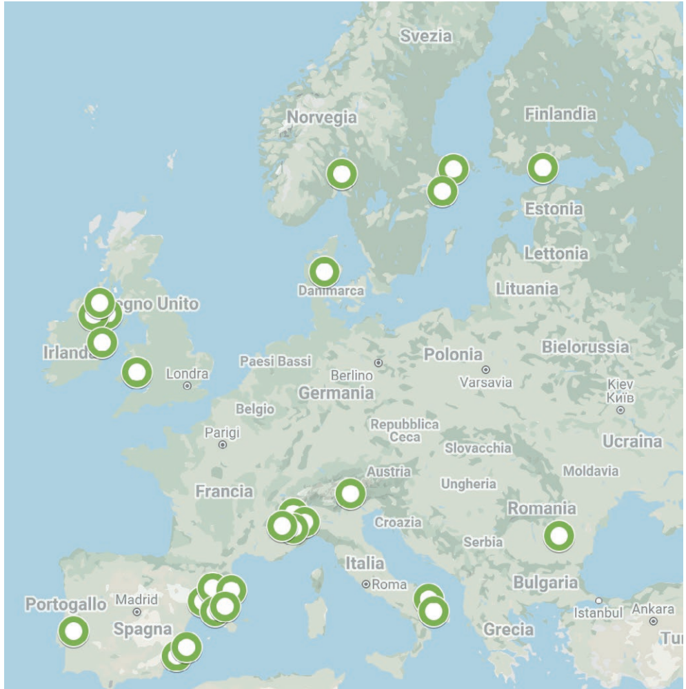
Figure 2. Effects of EPC ratings on real estate prices in Europe: countries covered by recent peer-reviewed articles.