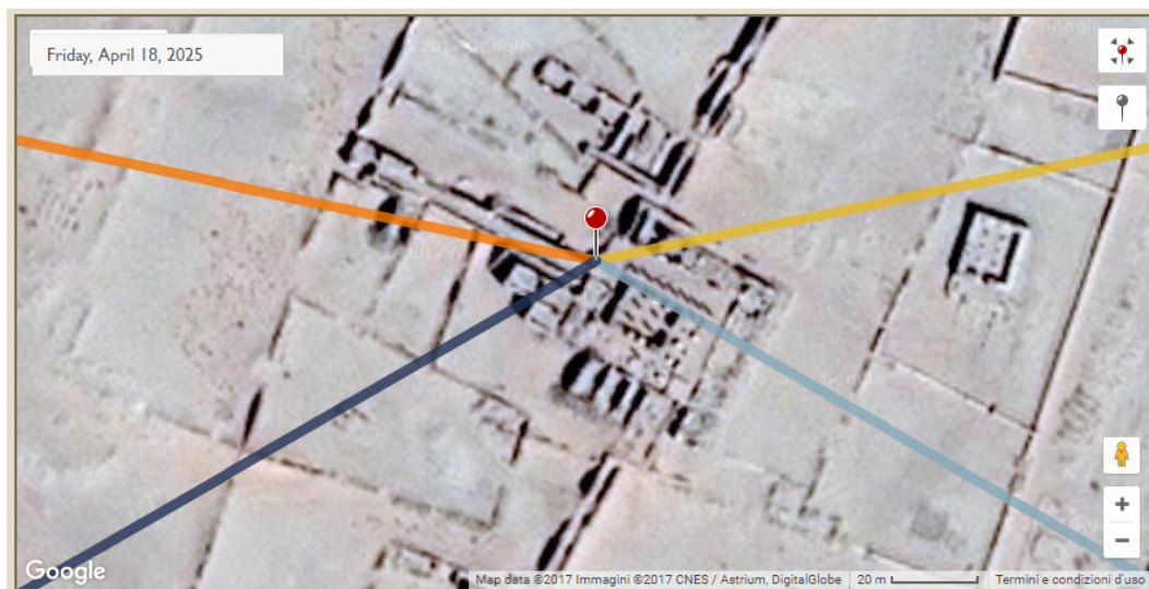
Figure 6: The Photographer's Ephemeris is showing that the central shrine in the enclosure is aligned perfectly along the southern direction of moonrise on a major lunar standstill.

Before using the Photographer's Ephemeris software in this case, it is necessary to discuss shortly the apparent behavior of the moon, which is more complex than that of the sun. The sunrise/sunset directions oscillates between the solstitial positions during a year, whereas the moon does the same during a nodal period (about 27 days). Moreover, the moon has a period – the lunar standstill period (18.613 years) – on which the values of the extremal directions (standstills) are changing. In this manner, there are major and minor standstills, of which we can calculate the directions that are depending on latitude. For a latitude of about 45^\circ , like that of Torino for instance, we have that the minor and major northern moonrise azimuths (directions) are 47.40^\circ and 65.65^\circ (angles are given from true north). The minor and major southern moonrise azimuths are 116.35^\circ and 132.58^\circ [21]. The azimuths of sunrise on summer and winter solstices are between these lunar azimuths.