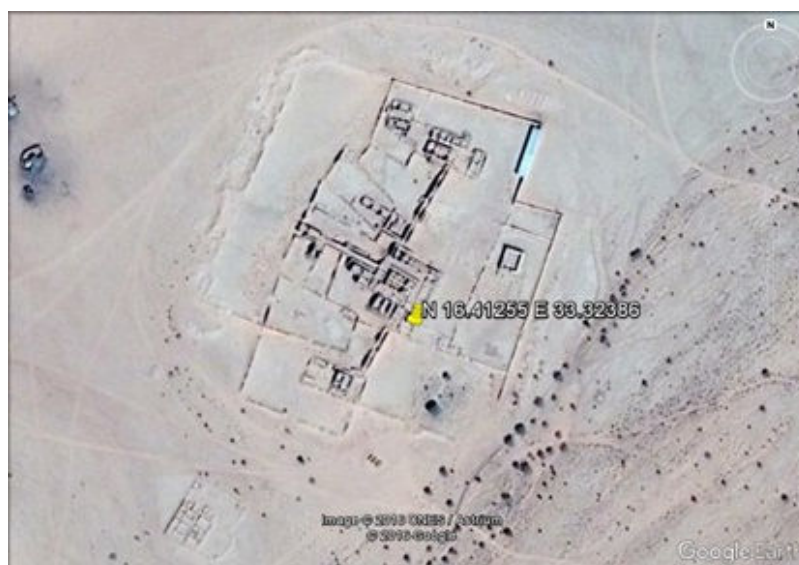
Figure 1: The Great Enclosure in Musawwarat es Sufra (Courtesy Google Earth).

Musawwarat es Sufra is a site of the Island of Meroe in the list of UNESCO World Heritage [6]. As told in [6], the Island of Meroe is a semi-desert landscape between the Nile and Atbara rivers. It was the heartland of the Kingdom of Kush, a major power from the 8th century BC to the 4th century AD. Besides Musawwarat es Sufra, the other archaeological sites of the Island are the royal city of the Kushite kings at Meroe, near the River Nile, and the nearby religious site of Naqa. As stressed in [6], these three sites comprise the best-preserved relics of the Kingdom of Kush, encompassing a wide range of architectural forms, including the famous pyramids, temples and palaces, and the productive areas that influenced the social and artistic scene of the Middle and Northern Nile Valley for more than a thousand of years. In the area, we can find also the water reservoirs of the Kushite people [7], which are also contributing to understand the paleoclimate in this area [6].