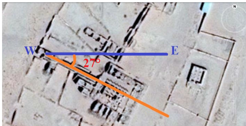
Figure 2: Axis of the central part of the Great Enclosure in Musawwarat es Sufra.

The idea that the enclosure had its axis oriented along the direction of the rising stars, and that this alignment changed to follow the effect of the precession, is very interesting. However, using the software Stellarium, in the direction of the axis of the temple (about 27^\circ from East, Figure 2), we do not observe the rising of a specific bright star. We see Sirius, but it is rising about 18^\circ from East. In the Figure 3, we show the sky simulated by Stellarium, for the site of the enclosure on 200 BC (other examples of the use of Stellarium are given in Refs.9-13). A remote possibility exists that the temple had been oriented to the southern direction of the rising of Venus (Figure 4), that is, along a standstill of Venus (an orientation along the standstill of this planet was used by the Mayan civilization [14]).