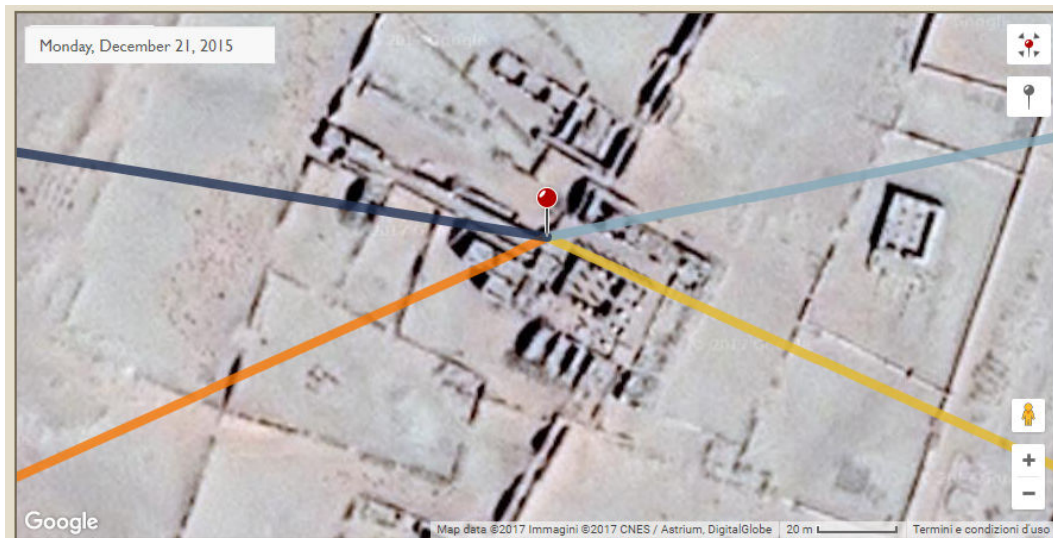
Figure 5: The Photographer’s Ephemeris is showing sunrise/sunset directions (yellow and orange) on satellite maps. The blue lines are the moonrise/moonset directions. Here we see the central part of the enclosure and the sunrise on the winter solstice.

Reference [8] was discussed also by [15]. The authors of [15] are arguing that it is possible a solstitial orientation of the central shrine dominating the enclosure; “perhaps the “slight” changes in the orientation were due to various successive attempts to find a satisfactory orientation for this important enclosure, only reached in the final construction phase” [15].