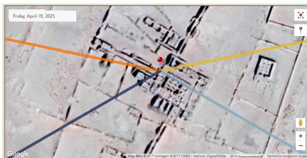
Figure 6: The Photographer's Ephemeris is showing that the central shrine in the enclosure is aligned perfectly along the southern direction of moonrise on a major lunar standstill.

Before using the Photographer's Ephemeris software in this case, it is necessary to discuss shortly the apparent behavior of the moon, which is more complex than that of the sun. The sunrise/sunset directions oscillates between the solstitial positions during a year, whereas the moon does the same during a nodal period (about 27 days). Moreover, the moon has a period – the lunar standstill period (18.613 years) – on which the values of the extremal directions (standstills) are changing. In this manner, there are major and minor standstills, of which we can calculate the directions that are depending on latitude. For a latitude of about 45^\circ , like that of Torino for instance, we have that the minor and major northern moonrise azimuths (directions) are 47.40^\circ and 65.65^\circ (angles are given from true north). The minor and major southern moonrise azimuths are 116.35^\circ and 132.58^\circ [21]. The azimuths of sunrise on summer and winter solstices are between these lunar azimuths.