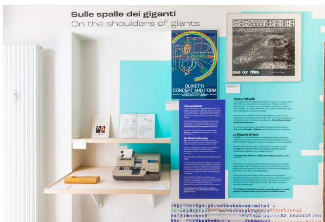
The room devoted to Olivetti's legacy of the exhibition Easy as a Kiss. Humanizing technology through design. Vision, story and impact of Interaction Design Institute Ivrea , curated by Jan-Christoph Zoels, Circolo del Design (Turin), 2021.

I came to interaction design from graphic design and typography. Designing a layout application in the 1980s, I realised that the everyday skills and knowledge of graphic designers could make software not only more beautiful but easier to use.