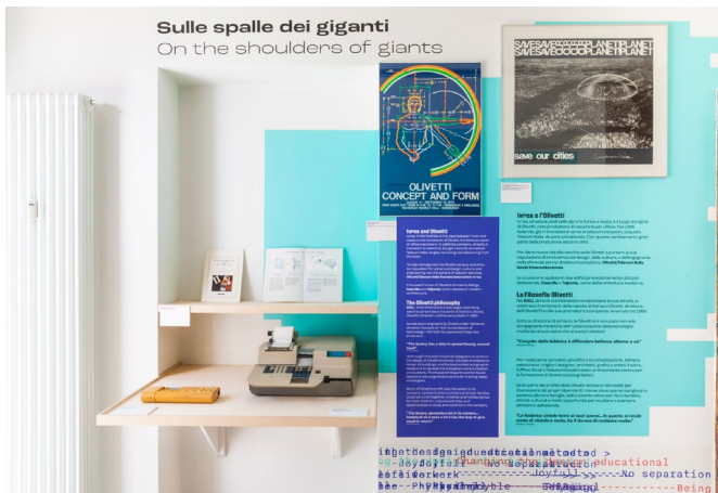
The room devoted to Olivetti's legacy of the exhibition Easy as a Kiss. Humanizing technology through design. Vision, story and impact of Interaction Design Institute Ivrea , curated by Jan-Christoph Zoels, Circolo del Design (Turin), 2021.

I came to interaction design from graphic design and typography. Designing a layout application in the 1980s, I realised that the everyday skills and knowledge of graphic designers could make software not only more beautiful but easier to use.