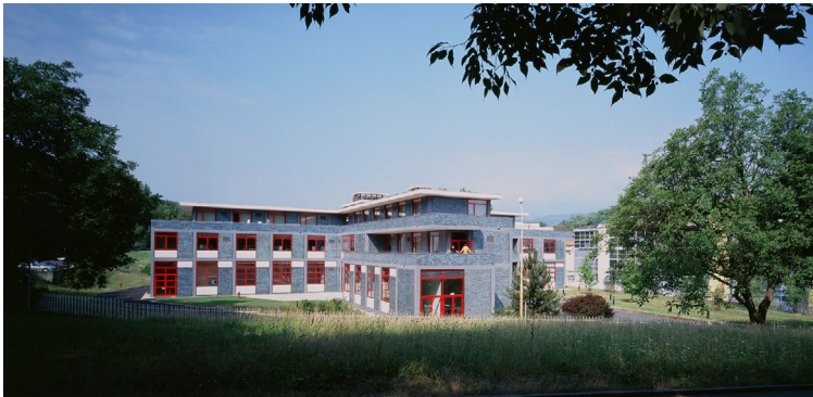
The Blue House, Interaction Design Institute, Ivrea.

He entered in Pirelli in 1986 and took over the operational leadership of the Group in 1992. He was chairman of Telecom Italia from 2001 to 2006.