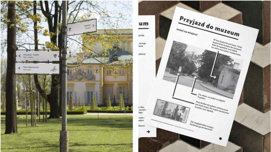
Figure 2. Signage project for the Wilanow Palace Museum, designed by Studio 2x2, 2015. The simple visual language is recalled in all communication artefacts, including the guidebook for autistic people.

In the perspective of inclusiveness, the studio created a specific guidebook for autistic people to help them have a more reassuring experience. Based on discussion with experts in the field, the information was translated into visual communication, considering the specific perception of the target users. This is an interesting example of a passive signage system with an integrative approach which enhances the value of the cultural site, leaving space for complementary accessibility-oriented actions.