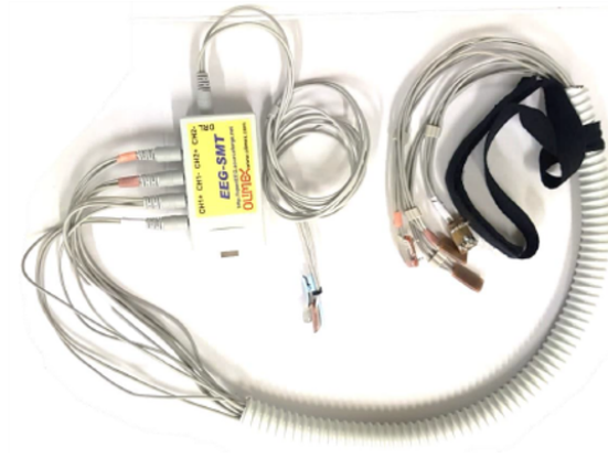
Fig. 2: Low-cost wearable EEG acquisition system.