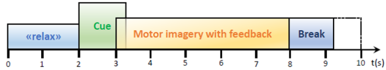
Fig. 3: Timing diagram of a single trial in the BCI experiment with neurofeedback.

The algorithm for EEG processing was the filter bank common spatial pattern (FBCSP), a widely adopted approach in MI-BCI [26, 27]. Of course, the algorithm was adjusted to provide feedback in real-time. Its main blocks were (i) an array of bandpass filters, (ii) the "common spatial pattern" (CSP) for extracting spatial features from the filtered EEG signal, (iii) a selector of features that discards the less informative ones, and (iv) a naive Bayesian Parzen window (NBPW) classifier. Notably, the classifier exploits signal features to assign a class probability to each trial. Therefore, the most probably class was assigned to the incoming EEG data for each trial, while the class probability was exploited as a score. These two pieces of information were exploited to modulate the intensity and direction of the feedback, respectively. It should be noted that the algorithm had to be trained by means of labeled EEG data. Since the users were completely new to the system, there were no available data for them, and the algorithm had to be trained from already available datasets. Furthermore, in adapting the algorithm for real-time processing, the trained model had to classify 1.0s-long time windows starting from t_{MI} and progressively shifting of 0.5s. This implies that, in the 5s-long motor imagery window, the signal was classified to provide feedback 9 times.