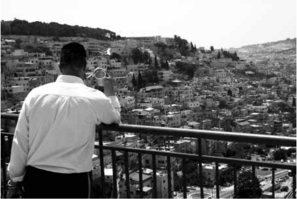
Overview of Silwan from the City of David archaeological site.

possible to discover which provisions of the plan are really achievable and, conversely, which provisions appear to be non-achievable.