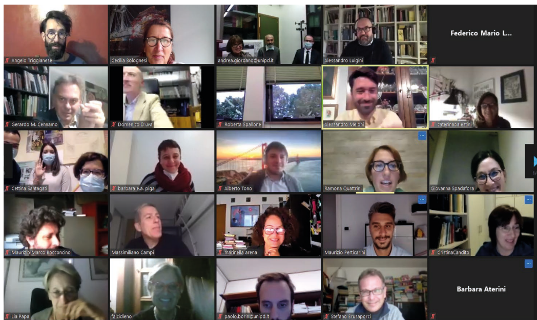
Fig. 1. Snapshot of the Zoom platform during the conference. Editing: M. Russo.