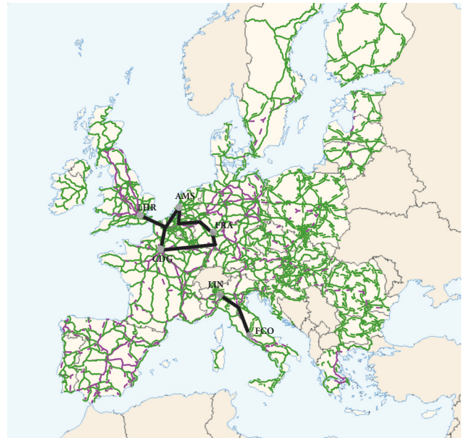
FIGURE 1: The EU Core Network Corridors (interactive maps at https://ec.europa.eu/transport/themes/infrastructure_en ).

The availability of High Speed Train (HST) lines opens the possibility of partial substitution with short-haul and medium-haul intra-EU flights. HSR services, either through modal competition or through cooperation, already exist among EU airports like Frankfurt Main, Paris CDG, Madrid Barajas, and Amsterdam Schiphol, which are all connected to the Trans-European HSR Network [11]. Despite the current state of development, the potential of HSR is still not fully exploited. One of the main aims for increasing the rail potential is the expected better environmental performance of this mode of transport: several studies defined the potential per-seat saving in emissions, achievable by substituting short-haul flights with HSTs [12, 13].