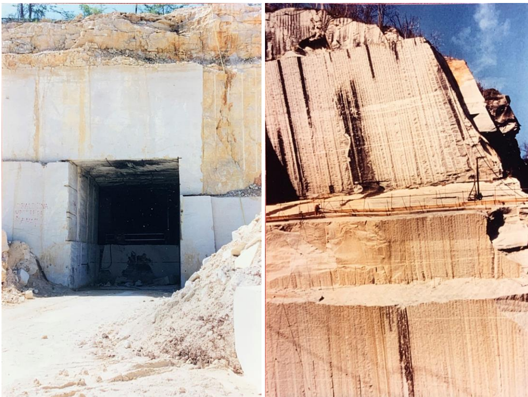
Figure 3. Left: underground voids in hard limestone obtained by cutting saw (Croatia). Right: dynamic splitting in granitic rock for dimension stone quarrying (Italy). Both cases represent good results in terms of stability and block recovery ratio.

Induced damage in rock mass means a drop of strength as a consequence of the opening or shearing of new or extended cracks and joints; this can affect both underground and open pit excavations and it is related to the existing discontinuity conditions. A lack in the contouring control is affecting construction costs: in tunnelling increased amount of support is requested to avoid rock falls and more sprayed concrete is necessary to fill up empty spaces; in quarrying poor blasting control determines higher agents consume and undesired effects (projections, inaccurate grain size distribution); in ornamental stone quarrying, as said, block recovery and safety during exploitation are strongly dependant on suitable profiling techniques following directions of geostructural pattern determination.