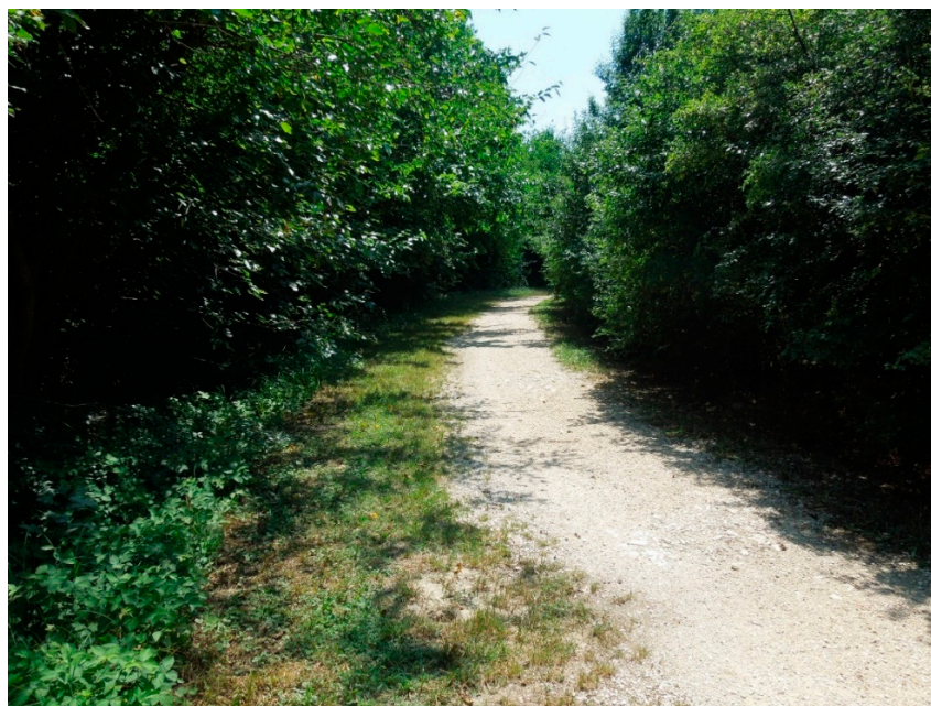
Figure 7. A pathway crossing Bosco Querini. Photo Emma Salizzoni, 2020.