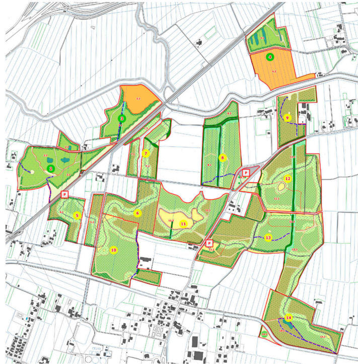
Figure 6. The Bosco Querini Management Plan (excerpt from Piano di Gestione del Bosco di Mestre—Carta degli Interventi, 2014, original scale 1:5,000): in lighter green, the sparse and visually permeable wooded areas that delimit the paths and meadows (highlighted in yellow) within the forest; in darker green, denser wooded areas, but still permeable to the eye; in brown, irregular and not permeable wooded areas that host the most delicate and inaccessible habitats (orange areas are dedicated to further woodland developments).

and irregular woodland is envisaged to discourage accessibility and host most delicate habitats (Figure 6).