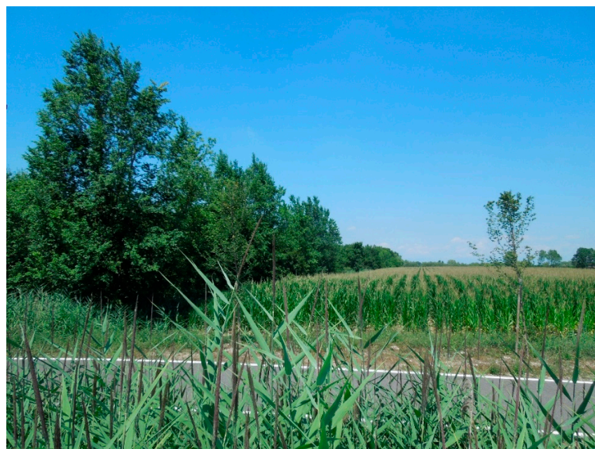
Figure 8. The close spatial interaction between Bosco Querini and the rural landscape. Photo Emma Salizzoni, 2020.