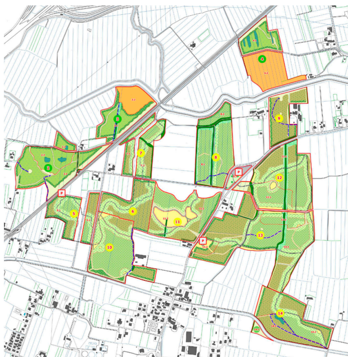
Figure 6. The Bosco Querini Management Plan (excerpt from Piano di Gestione del Bosco di Mestre—Carta degli Interventi, 2014, original scale 1:5,000): in lighter green, the sparse and visually permeable wooded areas that delimit the paths and meadows (highlighted in yellow) within the forest; in darker green, denser wooded areas, but still permeable to the eye; in brown, irregular and not permeable wooded areas that host the most delicate and inaccessible habitats (orange areas are dedicated to further woodland developments).

and irregular woodland is envisaged to discourage accessibility and host most delicate habitats (Figure 6).