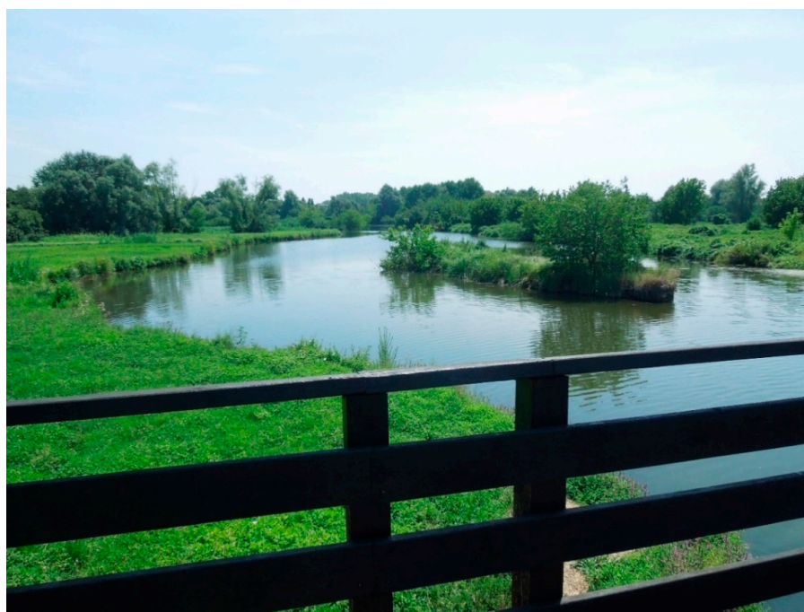
Figure 5. The walkway approaches the smaller islands without interfering with the newly recreated habitats in Parco Le Vallette. Photo Emma Salizzoni, 2020.