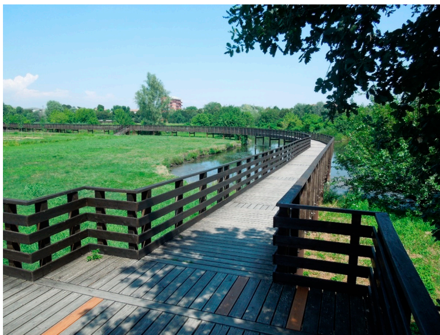
Figure 4. The walkway winding through the Parco Le Vallette wetland.

several points stretch out to the waters allows visitors to establish a direct relationship with the wetland and a visual connection with the islands and the wildlife that lives on them. Moreover, a raised cycle–pedestrian path made of wood and steel and running for a distance of about 500 m was set up, connecting the two parts of the town. The path winds its way through the central wetland, approaching the smaller islands and passing through the main one, but without allowing access to it. Crossing the walkway, it is possible to visually appreciate the wetland as a whole without interfering with the delicate habitats (Figures 4 and 5).