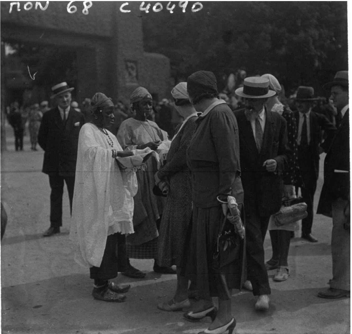
1: The indigenous women who presents their products to French women. ( gallica.bnf.fr / Bibliothèque nationale de France).

territory should be remain 'untouched'. Indeed, Henri Prost describes one of the main objectives of urbanism works as «to the respect of these local values» [Prost 1932].