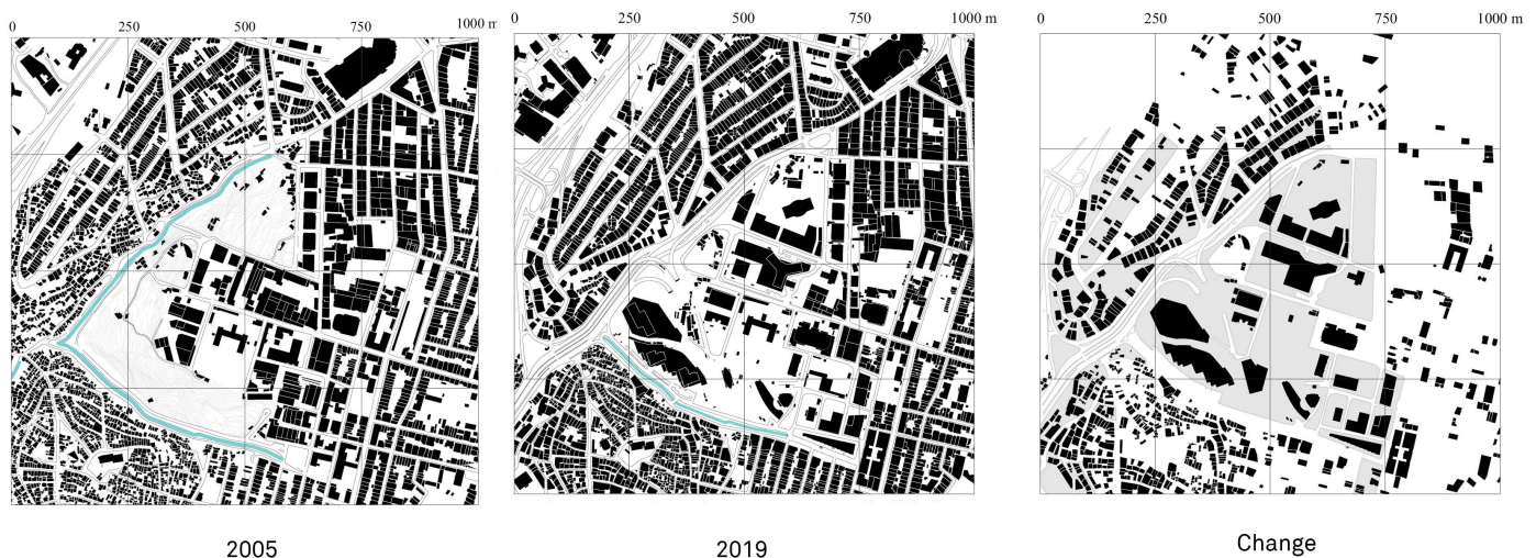
Figure 3. Transition of the building fabric in Bomonti.

at the beginning of the 21st century, later, a central business area in 2005, and received intensive zoning rights to encourage private developers. This decision potentially was shaped due to the existing lands whose construction permissions were increased. Accordingly, large capital groups started to deposit their capital in the area and turned this place into a profitable investment occasion by purifying the manufacturing identity to host business activities together with residential, hotel, and entertainment functions.