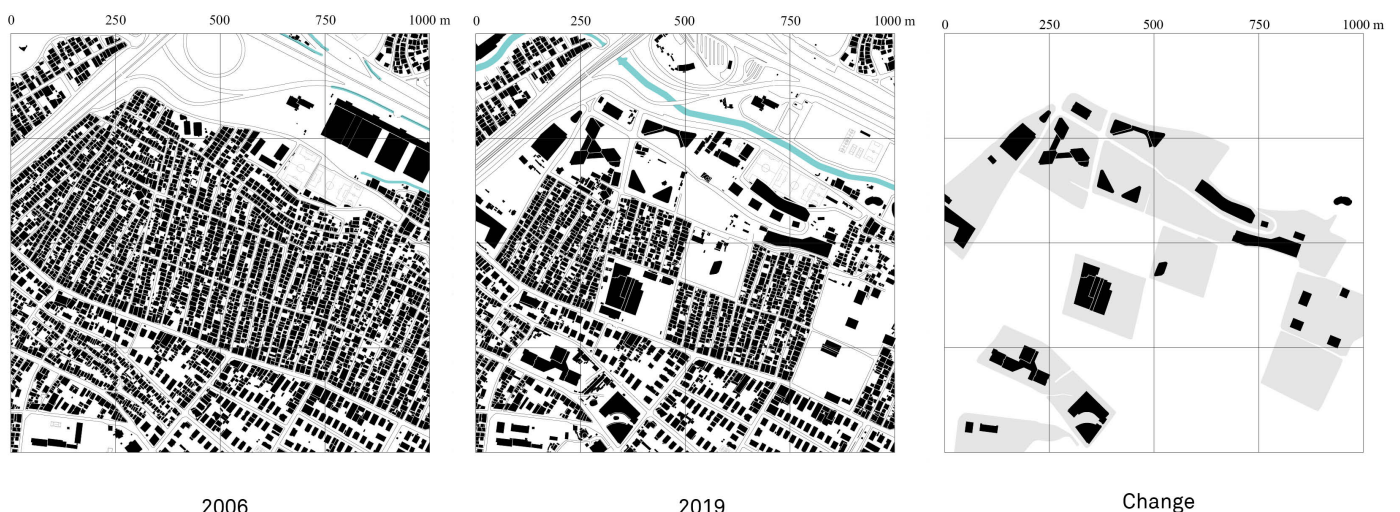
Figure 1. Transition of the building fabric in Fikirtepe.

Through the comparative maps, it can be noticed that the transformation, in this case, takes on a large scale. The demolitions are realized at a plot scale and the existing low-rise dense urban forms are being replaced by high-rise urban form. The street pattern remains the same, spindly plots are unified forming larger square plots with more open space. Newly constructed skyscraper typologies are laid out as detached urban elements in different shapes on the map. Projects like Concord Istanbul, Brooklyn Park, Elit Concept, Mandarin Acibadem are some examples of the luxury towers that put together residential, office, and commercial functions together. These are destined to medium to high-income consumers of the 21st century that has different consumer preferences respect to former residents