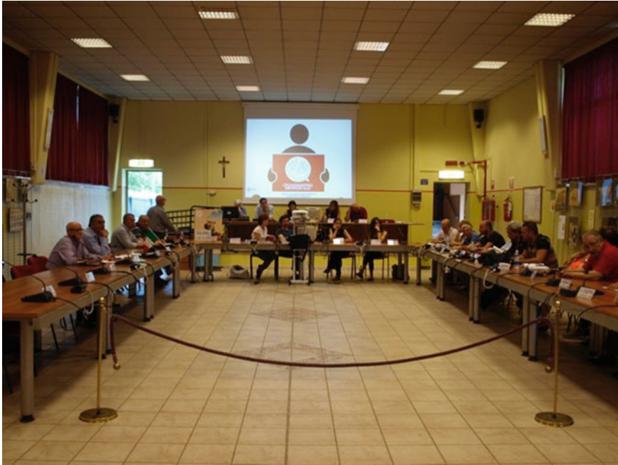
Fig. 11.1 Public meetings with the engaged stakeholders