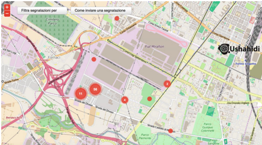
Fig. 11.2 Crowdmapping reports on the web-based map provided by Ushahidi

which might not always be available. That was an essential element for the implementation of the project in order to achieve social inclusiveness by providing the possibility to report from any kind of mobile device. Outcomes of data collection were published to make them accessible to the local authorities. In the meanwhile, an analysis of data was needed, in order to understand the weak points and to further discuss with people, and so a plan of activities, such as traditional meetings to transect walks, was set up (De Filippi et al. 2017a). This process was important to enhance public participation, involving people from the first to the last step (Fig. 11.3).