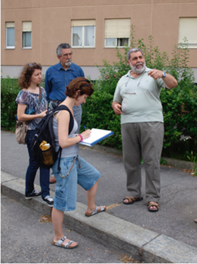
Fig. 11.3 Data collection with the community (transect walks)

requirements specification. In particular, in order to ensure the tool compliance and integration into the current administrative process, the managing executives and the public officers have been involved in each step in co-creating and testing the technological platform.