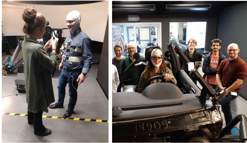
Fig. 4. The final Application Experiment on the Dynamic Vehicle Simulator at AVL

The algorithm, in these cases, can predict the falling asleep phase with an average of almost 3-4 minutes.