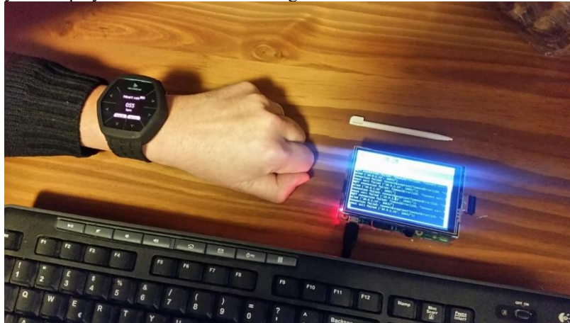
Fig. 2. Wearable CPS and data logger

For a real-time acquisition and detection, the algorithm has been implemented on a wearable device. The system is composed of a powerful wearable development platform, named Hexiwear, and a Raspberry PI. The first one acquires the signal, elaborate it and send the results in to the Raspberry PI through Bluetooth, where they are displayed and then saved in a log file.