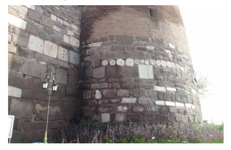
In this and in the following page. Reuses of roman spolia as new bricks of costruction. Reuses of roman spolia as new bricks of costruction.

tral to the touristic routes of the city, as of today the visit to the asset are merely functional to the panoramic view of the urban centre, thus disregarding any understanding of the fortress architecture (Serin 2005). As further confirmation of the inadequacy of the communication system of the asset's value, no promotional tool is available in the area (e.g. visiting tours, information boards, points of interest, etc.) and that the fruition of the fortress is accessible without meeting any instrument for the comprehension and a more in-depth analysis of the building. Moreover, the area included in the Citadel has been subject, over the years, to a number of transformation interventions aimed at bringing the existent buildings (that until few years ago lied in a state of ruins) back to the historic confirmation dating to the first half of the 20th century, by restoring or reconstructing building systems or volumetrics destructed by subsequent modifications. Such a