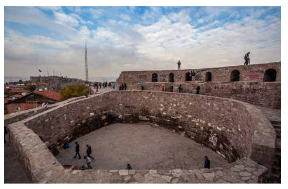
The main square inside the Citadel structure.

wall and a series of defensive and sighting towers that entirely surround the structure. It is equally fascinating pointing out how the fortress declares its own past through the presence of inscriptions and spolia (Romeo, Rudiero 2014). The structure is indeed distinguished by the presence of a great quantity of counting material in the defensive stonework and of inscriptions reporting the restoration date of the Seljuk period. Even more, captivating within the analysis of the building are the numerous examples of reuse of classical elements. Very widespread across Asia Minor and not only, but this practice is also particularly relevant for the specific case of Ankara and constitutes a precise feature of the castle, which strengthens the link with the past and the urban heritage. Also, thanks to the contribution of the archaeological missions that took place on the territory in recent years, the city of Ankara is home to a remarkable heritage of the classical era and pre-