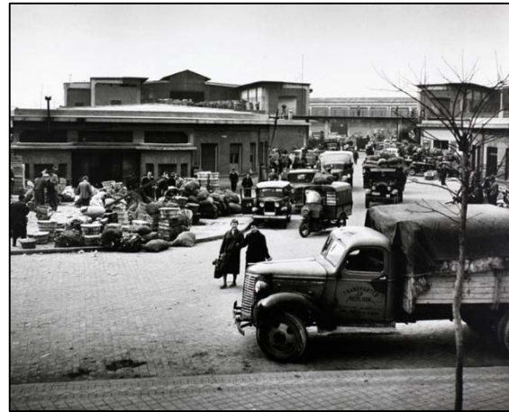
Fig. 3 Entrance of the Mercado from the Plaza Legazpi in 1960 at the height of its activity.