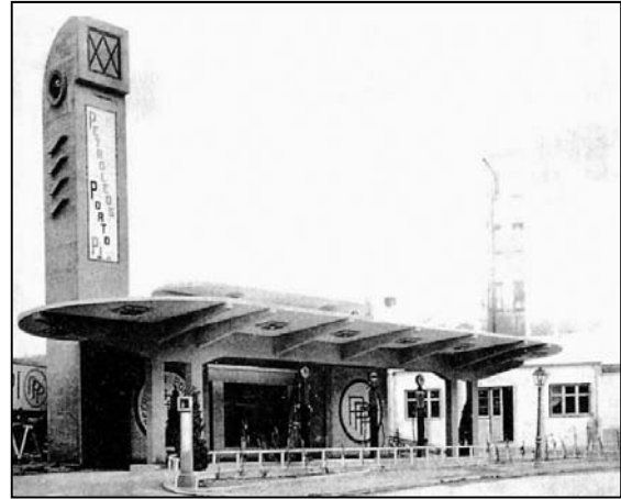
Fig. 2 Gasolinera de Porto Pí Madrid, by Casto Fernández Shaw, 1927. Oil on canvas, 54x65 cm, by Damian Flores.

The works of this generation are therefore characterized by a progressive breath that cannot yet be assimilated to the orthodox rationalism of GATEPAC . We could rather speak of a pre-rationalist chapter, since they are situated in a space halfway between the simple survival of traditional styles and the extreme representations of the modern (Fig. 2). The desire to stay out of the "purity of ideas" has meant that the two groups have not joined together, even though most of the projects of this generation follow the guidelines then undertaken by GATEPAC as well as the critical attitude of the Generación del '25 . Three works mark the beginning of the group and define its spirit: the first is the gas station of Porto Pí (Fig. 2), by Casto Fernández Shaw , built in 1927 in Madrid, a work intentionally designed and stripped of all ornaments and accessories. The second is the house of the Marquis of Villora , also built in Madrid by Rafael Bergamín in 1928-1929, entirely in exposed bricks,