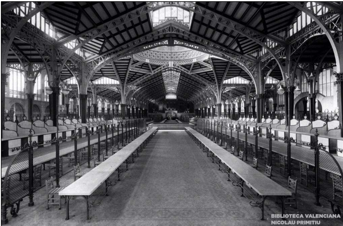
Fig. 1 Interior of the Valencia Market a few days before its inauguration in 1928. Work began in 1910.

The Spanish architecture of the twentieth century is strongly linked to some events that occurred between the end of the previous century and the beginning of the twentieth. The loss of many colonies during the Hispanic-American war has generated new nationalist feelings that have merged into an architecture with typically Spanish models that reinforced the national closure. At the same time, however, an architecture was being developed that was the opposite of the nationalist, inspired by modern European models. In recent years, the capital has favored the traditional styles linked to the neo-Mudéjar and decadence of the Belle Époque . Following the conflicts between the working class and the army in Barcelona in 1909,