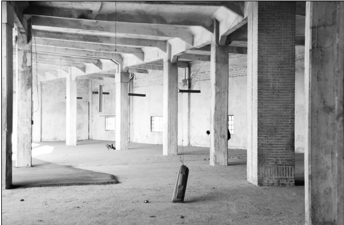
Fig. 4 Mercado de Legazpi in 2015. Detail of the structure on the first floor of the building.

compares their design with that of an operating theatre. The careful design of the new models of the Plan de Mercados influenced the subsequent public architecture and placed Madrid in the scenario of the Modern Movement. A new demographic increase in the sixties led the municipality to take new measures, which in 1973 merged with the Mercamadrid company, with which the commercial functions of the city were relocated, determining the end of the large markets of the early twentieth century. Analyzing the evolution of Spanish and, above all, Madrilenian architecture in the 20th century is a necessary process for understanding the evolution of the Mercado de Legazpi , which today remains the emblem of Madrilenian rationalism and is one of the first examples in Madrid of large reinforced concrete buildings. It is spread over a space of about 30,000 square meters within the lot to which it belongs, from which it takes over the triangular shape. The building is developed on two levels, with the exception of the two buildings adjacent to the Plaza Legazpi which delimit a smaller courtyard, and which was the