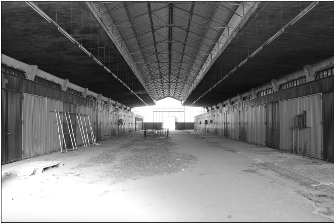
Fig. 5 Mercado de Legazpi in 2015. First floor with subsequent additions due to various changes of function.

access area to the market area. At the center of the large inner square was a small structure in which the services were located, isolated from the storage and sales areas for hygienic reasons and the width of the space was designed for vehicular traffic. The internal space of the Mercado is marked by rows of concrete pillars that form six bays whose outer space housed the rail. The repetitiveness of the obstacle-free construction system gives a solemn view of the environment. On the first floor, the lack of two rows of pillars gives way to a central corridor, a passage for the means of transport for goods that entered the building directly from the Puente de la Princesa . The structure of the building allowed three different flows: pedestrian, road and rail.