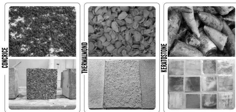
Figure 1.1 Specimens manufactured from agricultural by products and waste. From left to right: Concrice; Thermalmond; Keratostone.

To assess the environmental impacts of the Keratostone mosaic, an LCA study was performed. The analysis revealed that the contributions linked to the manufacturing process of the glass fibre gripping net onto which the mosaic tiles are glued are particularly significant. In the perspective of an improvement of environmental performances, this material could be replaced with one having lesser impact, considering, for example its replacement with a coconut fibre mesh.