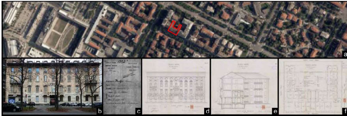
Figure 1. The case study: Palazzo Maffei in Turin. a) the building and its urban context; b) main façade; c), d), e), f) original project of Palazzo Maffei from the Building Archive of the City of Turin, all right reserved.

measure on a drawing) and bring it back on the drawing itself. As a process of knowledge, all the iconographic apparatus represents a tool to study its author's graphic codes and to correctly interpret their use. First, we focus on the façade, extrapolating the measurements from the project plans, suitably scaled. In order to prepare the student for the survey of the façades through the use of the RDF software.