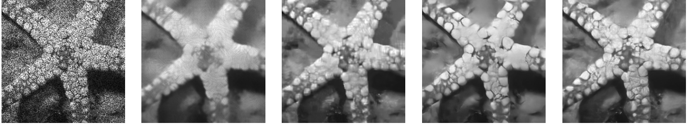
Fig. 2. Synthetic images: Noisy, PPB (21.13 dB), SAR-BM3D (22.71 dB), SAR-CNN (23.37 dB), our method (23.32 dB).