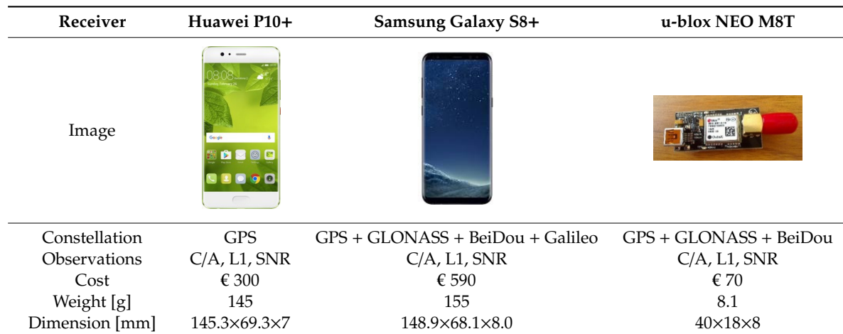
Table 1. The instruments used in these tests.

To generalize the results in terms of environmental conditions, two different test sites were investigated: the first test-site was one the rooves at Politecnico di Torino (Italy), an area where the noise and multipath effects are very high and where the satellite visibility is reduced due to the presence of other buildings. The second one was an open-sky site characterized by the absence of reflective surfaces, electromagnetic disturbances, and with optimal conditions for tracking satellites (e.g., no obstructions). These two sites, namely A and B, depicted in Figure 1, respectively, represent the two main conditions where a user works or tries to perform positioning activities.