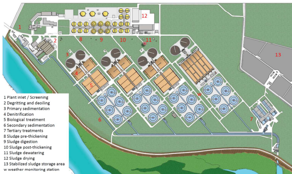
Figure 1: Plant of SMAT's WWTP [9].

SMAT's centralized civil WWTP is the largest chemical, physical and biological treatment plant in Italy. The plant treats municipal and industrial wastewater with a capacity of more than 2,000,000 of equivalent inhabitants. It consists of four lines devoted to the wastewater treatment and one line for sludge treatment. The water line, with an average flow rate of about 25,000 m 3 /h, is made up of the following processes: grid screens, grit and grease removal, primary sedimentation, pre-denitrification, biological treatment, secondary sedimentation, phosphorous removal and final filtration (Fig. 1).