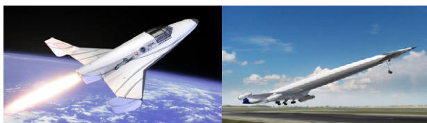
Figure 1: Examples of a new generation of spacecraft and aircraft. Project created by the XCOR Aerospace (on the left) and a European design project called LAPCAT A2 (on the right).