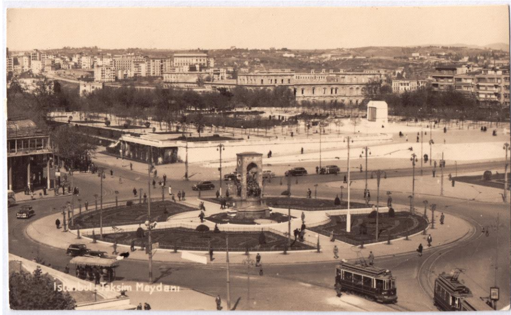
Figure 1. Taksim Square in 1940s 2.

the social life through modern public spaces that did not exist in Ottoman traditional life. Achieving this aim has led to the shaping of Taksim – Maçka Valley by integrating ‘green spaces’ with ‘public buildings’. In other words, by supporting Taksim’s existing public identity coming from the Late Ottoman Period, Prost prepared a plan for Taksim – Maçka Valley (named as Plan Park No 2) by conceiving as a public park with continuous public functions. His plan was realized in the 1940s (see Figure 1). His vision made Taksim Republican Square as a modern city center of İstanbul. In addition, Gezi Park was formed to the place of demolished Topçu Barracks. The park became the first public park where women and men easily and freely could enjoy daily life together.