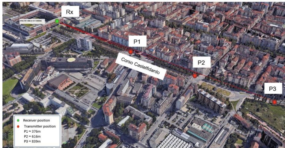
Figure 2. Setup 2. Transmitters (P1, P2 and P3) and receiver (Rx) position, with relative distance indications.

Frequency 865.2 MHz Antennas gain 3.16 dB