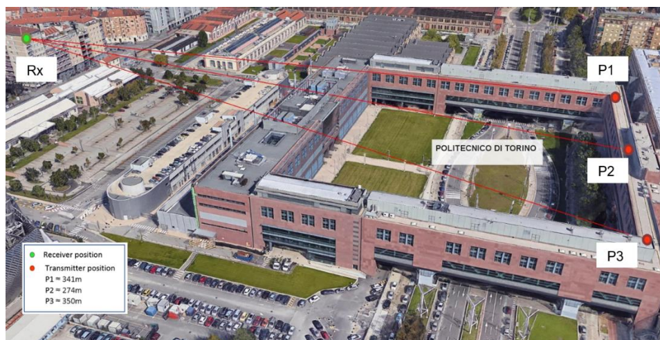
Figure 1. Setup 1. Position of the transmitters (P1, P2, P3) and of the receiver (Rx) with relative distance.

The receiver positions P1 and P3 were in line of sight with the transmitter while the position P2 was behind an obstacle. This fact allowed also to check the signal quality when the transmitter is not completely in line of sight with the receiver. This is a common situation for an urban environment where potential transmitters can be partially, or totally shielded by houses. It is important to mention also that, below the receiver position P3 and along the south side of the roof, there was a metal structure that could also introduce