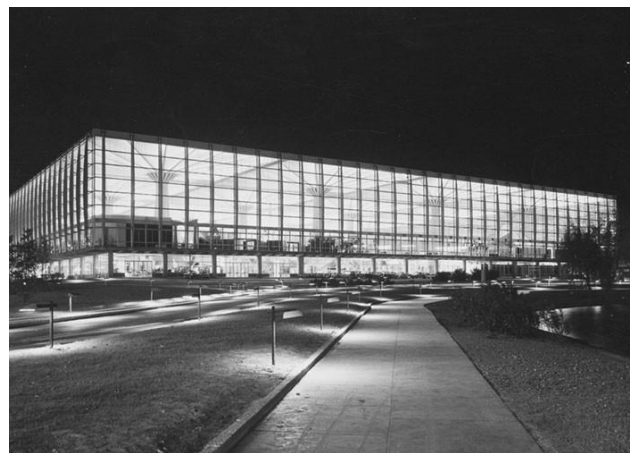
Figure 1: Palazzo del lavoro, night view, 1961.

They reflect its dimensions, on which Bruno Zevi had already spent some criticisms, as they discouraged his reuse. Palazzo del Lavoro covers a square plan of about 25000 square meters, 650000 mc. The roof is supported by 16 impressive 26 meter-high-ferrocement pillars whose cross-shaped base is 5 m and at the top of which the metal beams that support the roof are bolted. The elevations, 12160 square meters, are characterized by a curtain wall supported by 128 18.6 meter-high ritti among which, with the exception of those located in the North, oriented sunshade slats were welded.